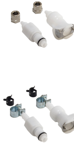
ReproCare GLFC-10P Pneumatic Hose Compatible Connector