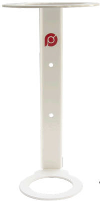
ReproCare GLFB-20 VOC Holder Filter Bracket